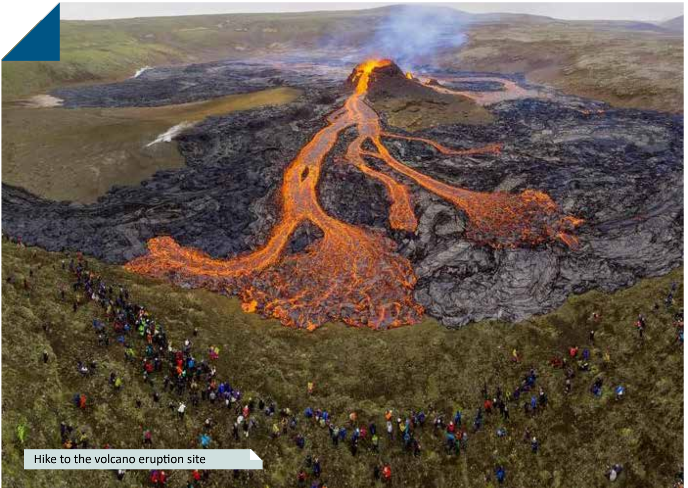
Hike to the volcano eruption site